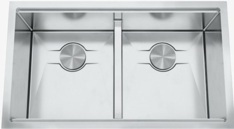
INTRODUCING THE LUVUL COLLECTION